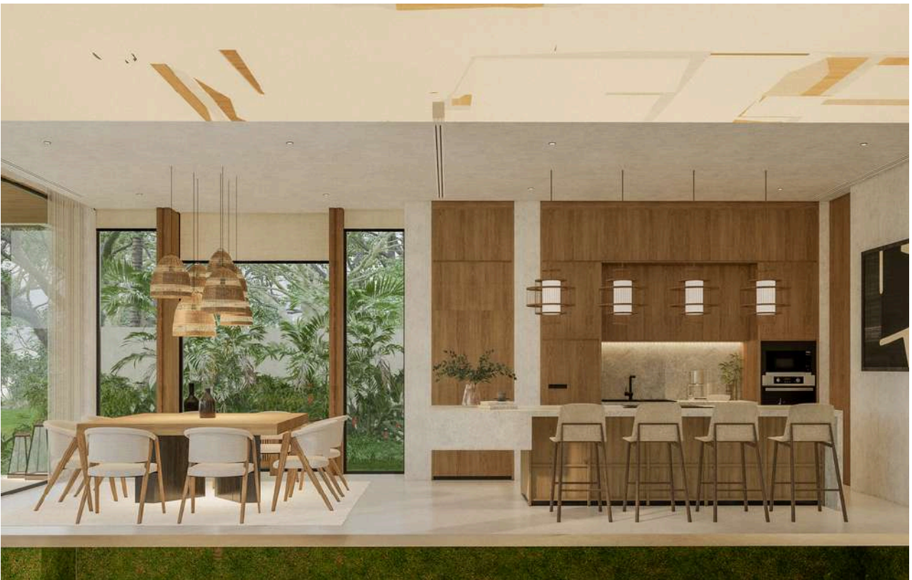
KITCHEN AND DINING